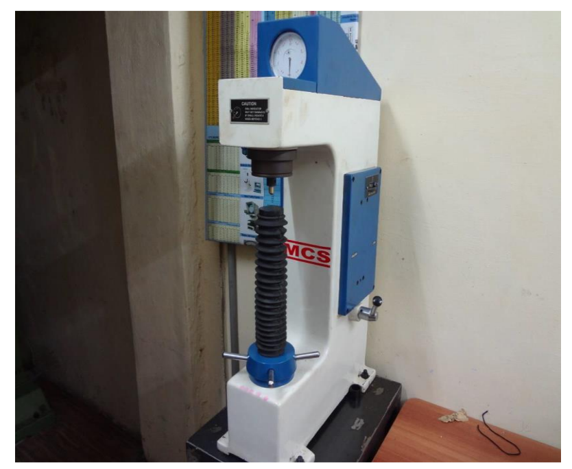
Figure 1: Vickers Hardness Testing Machine.

Figure: 1Shows the hardness test unit from Vickers The hardness that is the deformation resistance of the specimens is a measure of plastic or constant deformation resistance. In this analysis, the static indentation test was used to verify that the specimens of a ball indenter were hard on the specimens that were examined. The relationship between the overall test force and the indentation area or depth produces hardness measurements. The hardness measurements were carried out in accordance with the requirements of ASTM E10.